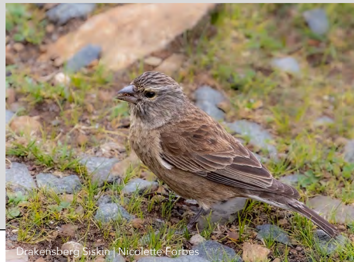
Drakensberg Siskin