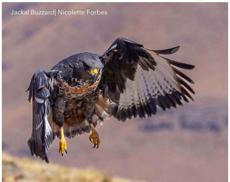
Jackal Buzzard