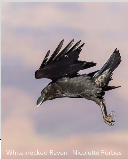
White-necked Raven | Nicolette Forbes