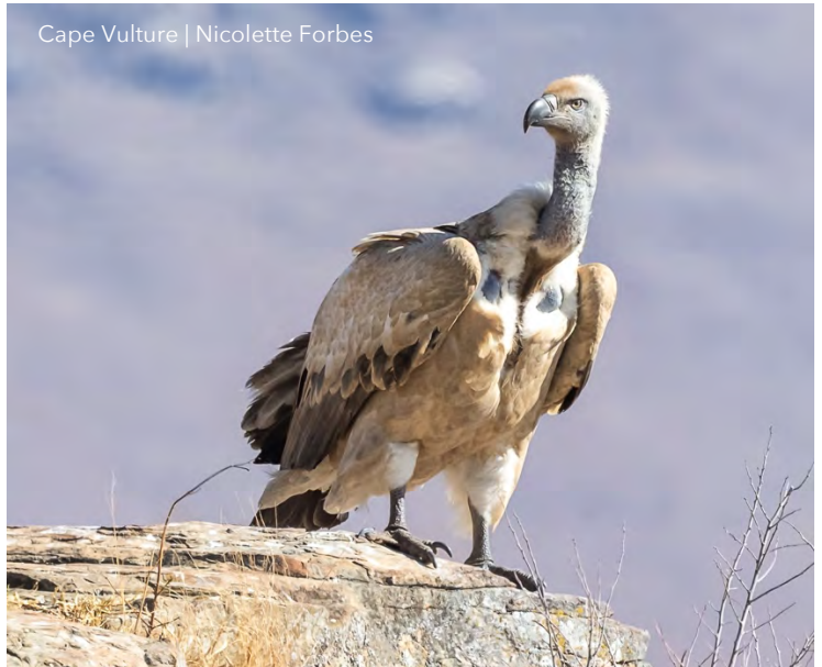
Cape Vulture | Nicolette Forbes