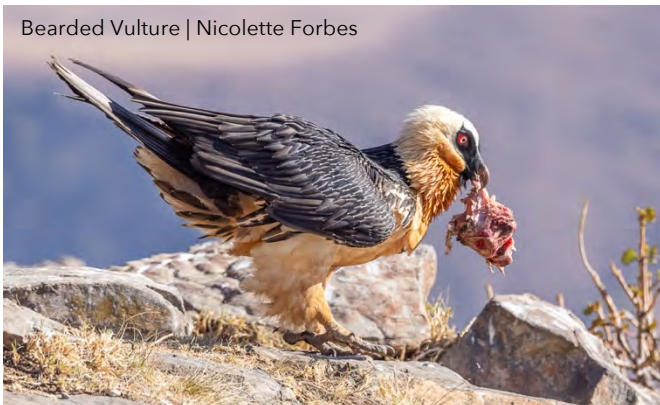
Bearded Vulture | Nicolette Forbes